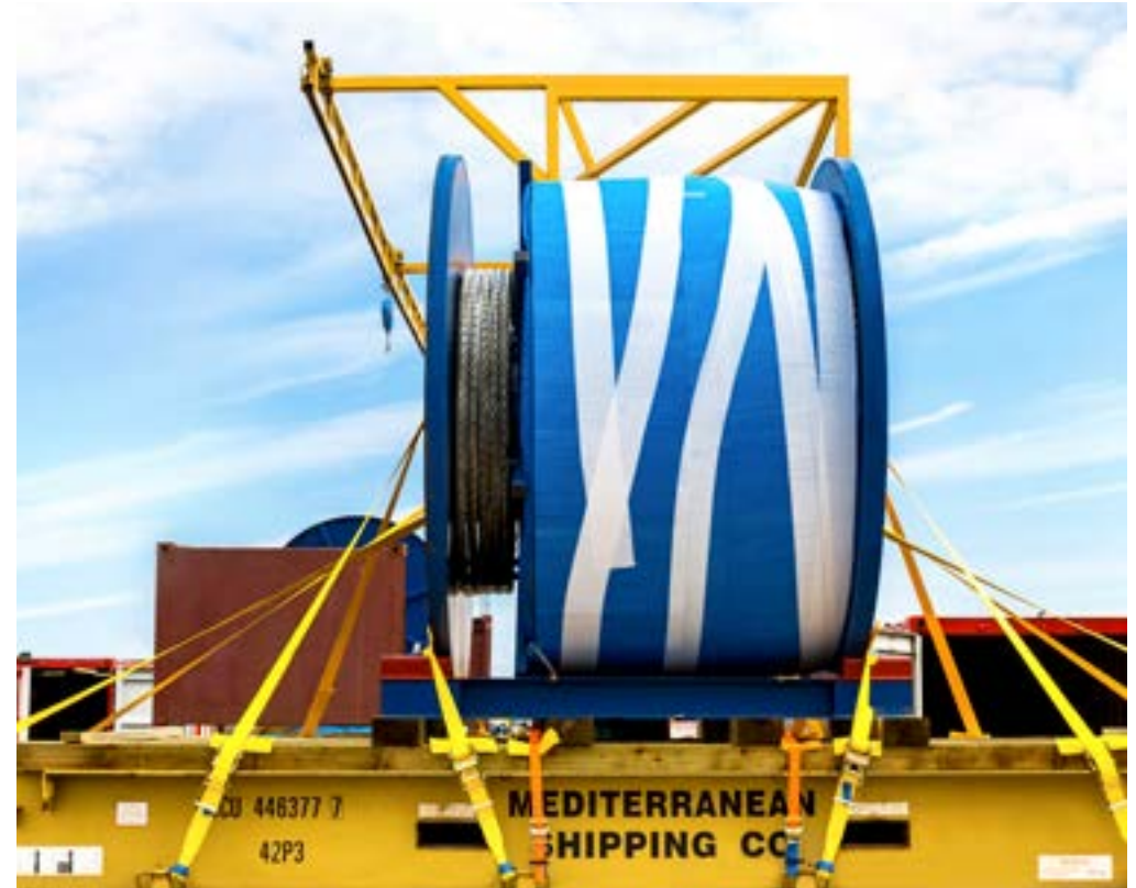
Out-of-gauge cargo loaded in Felixstowe

Our experts assure you of a tailor-made solution for a safe and secure delivery