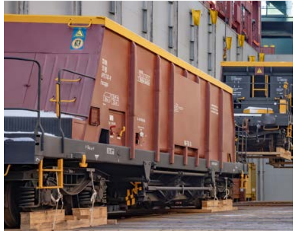
11 rail hopper wagons shipped in the same voyage from Antwerp to Montevideo.

As part of our feasibility studies and preparation, 3D modelling is used to demonstrate handling stowage and lashing requirements