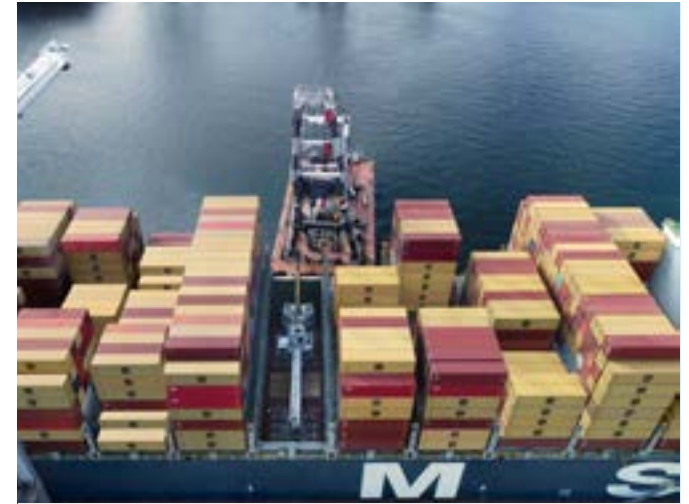
280 tons crane loaded with a floating crane from Europe to Singapore. Dimensions of 33 meters in length, 6.74 meters in width and 12.17 in height.