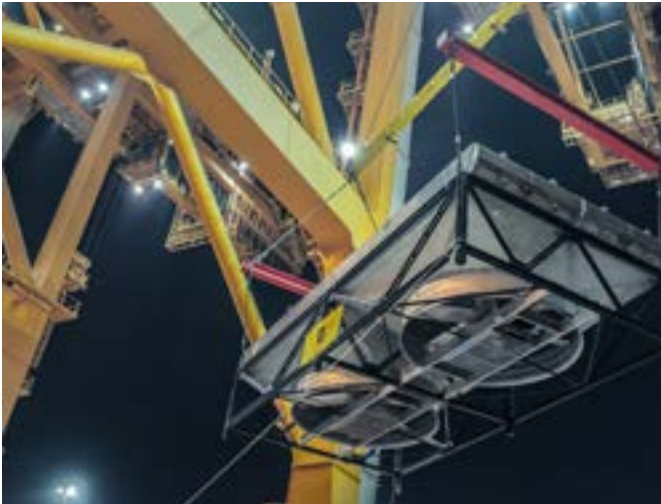
8 Heat exchangers shipped from Jebel Ali to West Africa using shore Gantry crane.

We are committed to finding the best transport solution for your special cargo, whatever its dimensions, weight and destination.