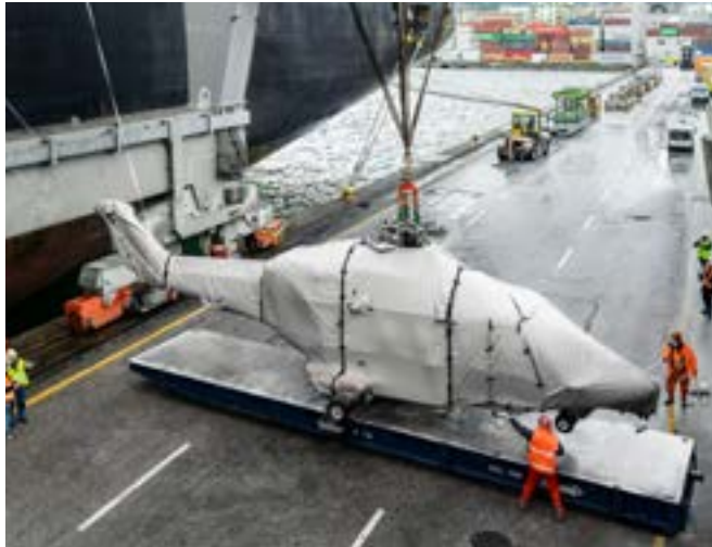
Helicopter shipped from La Spezia to Nhava Sheva with one lifting point: the rotor.